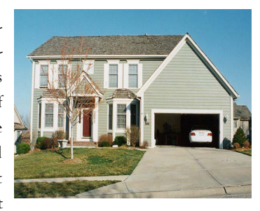
HELP CLOSE THE DOOR ON CRIME IN YOUR NEIGHBORHOOD

The remedy is a simple one; please secure your garage and residence to reduce your risk of